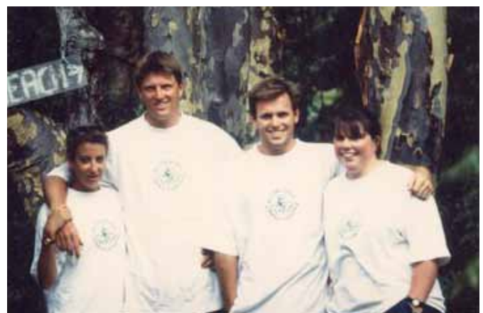
The Egan kids