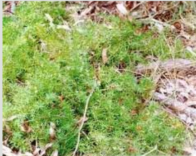
Above : Asparagus fern Right: Polygala myrtifolia