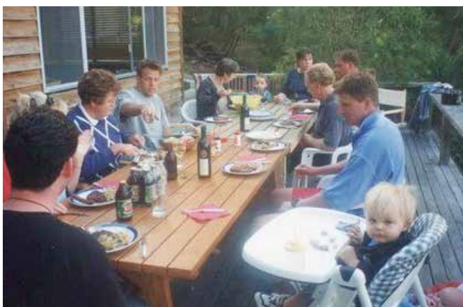
Christmas at Rosie