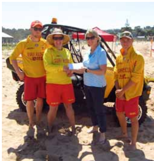
Batemans Bay Surf Life Savings Club delighted with our donation

The surf club at Malua Bay is being refurbished – expect it to be finished by Christmas. As well as meeting the lifesavers' needs, the club will provide a venue for functions and training. We'll be in touch with the president once the work is finished to arrange a new round of training for Rosedale Association members. Council is also looking at running more training programs early next year. We'll keep you informed!