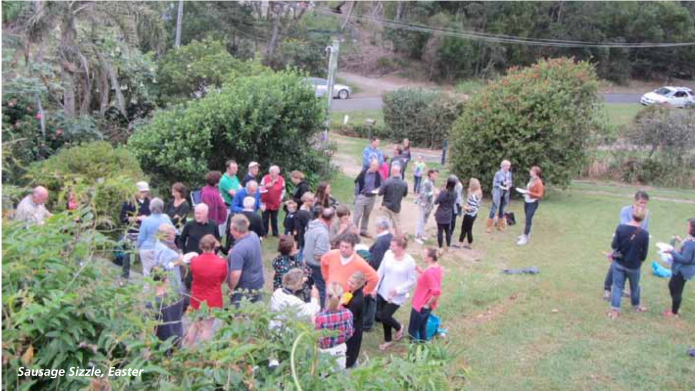
Sausage Sizzle, Easter