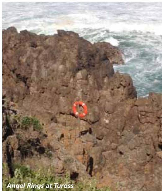
Angel Rings at Tuross