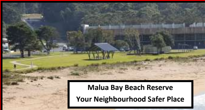
Malua Bay Beach Reserve Your Neighbourhood Safer Place

An Emergency Warning is the highest level of Bush Fire Alert. You may be in danger and need to take action immediately. Any delay now puts your life at risk.