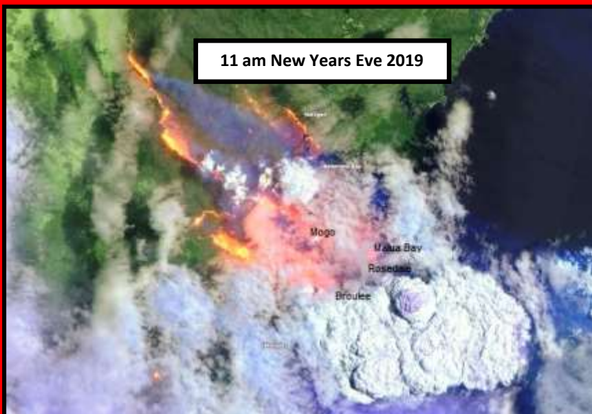
11 am New Years Eve 2019

Until outside help arrived mid morning, our remaining 6 Brigade firefighters had only a mid size truck (with a crippled main pump) and a small truck with limited fire fighting capacity. It was frustrating for us to be confronted by so large a threat with so few resources. Nevertheless, over some exhausting hours, and with significant help from other firefighting units, we were still able to save many houses. In the following week, we labored to extinguish the remaining southern flank of the fire in the Guerilla Bay/Barlings Beach area. Over the rest of January, we were attending to residual fires within the Brigade area almost every day.