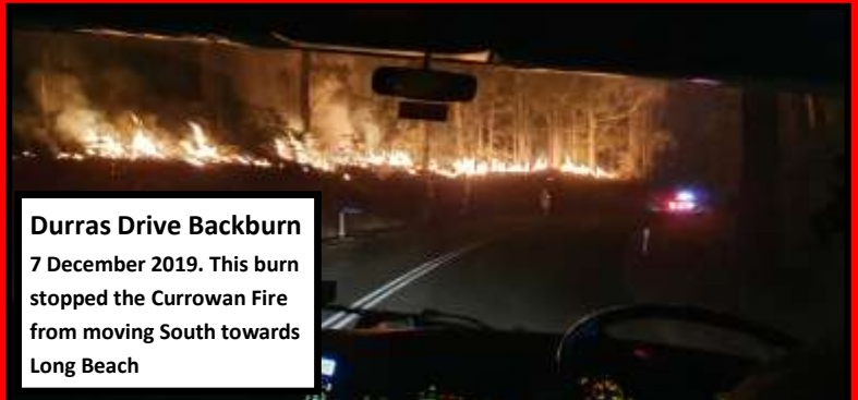
Durras Drive Backburn 7 December 2019. This burn stopped the Currowan Fire from moving South towards Long Beach