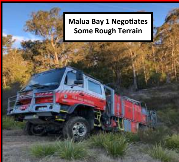
Malua Bay 1 Negotiates Some Rough Terrain