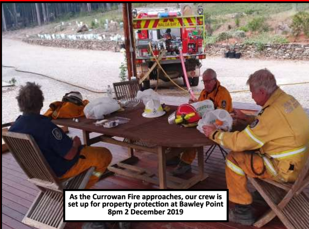
As the Currowan Fire approaches, our crew is set up for property protection at Bawley Point 8pm 2 December 2019