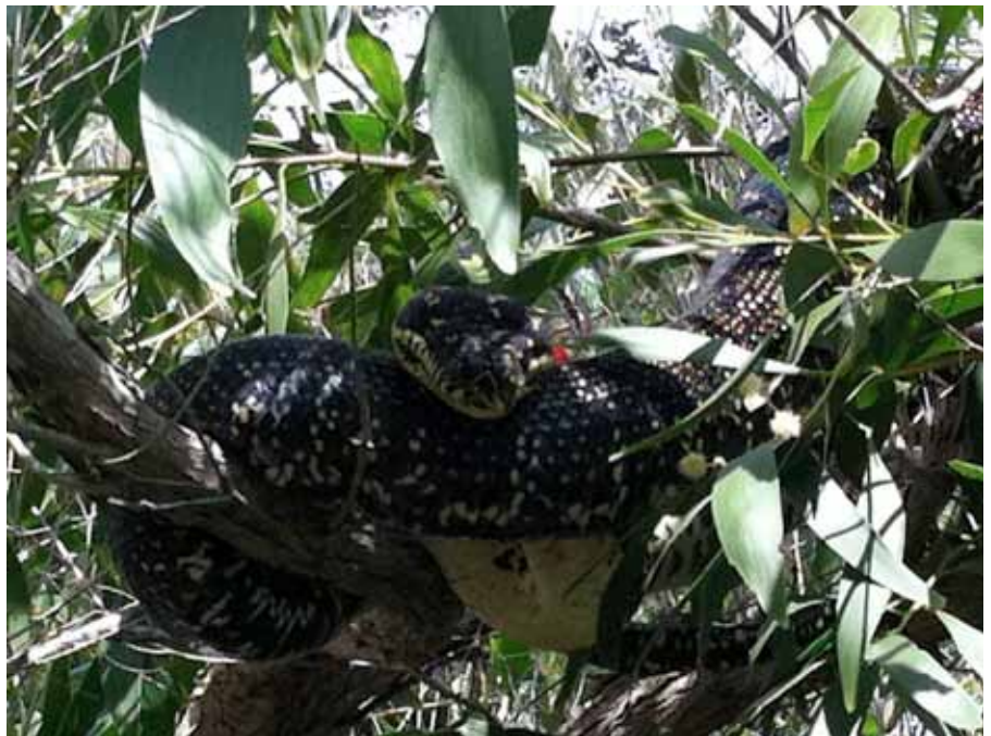
DIAMOND PYTHON (ABOVE)